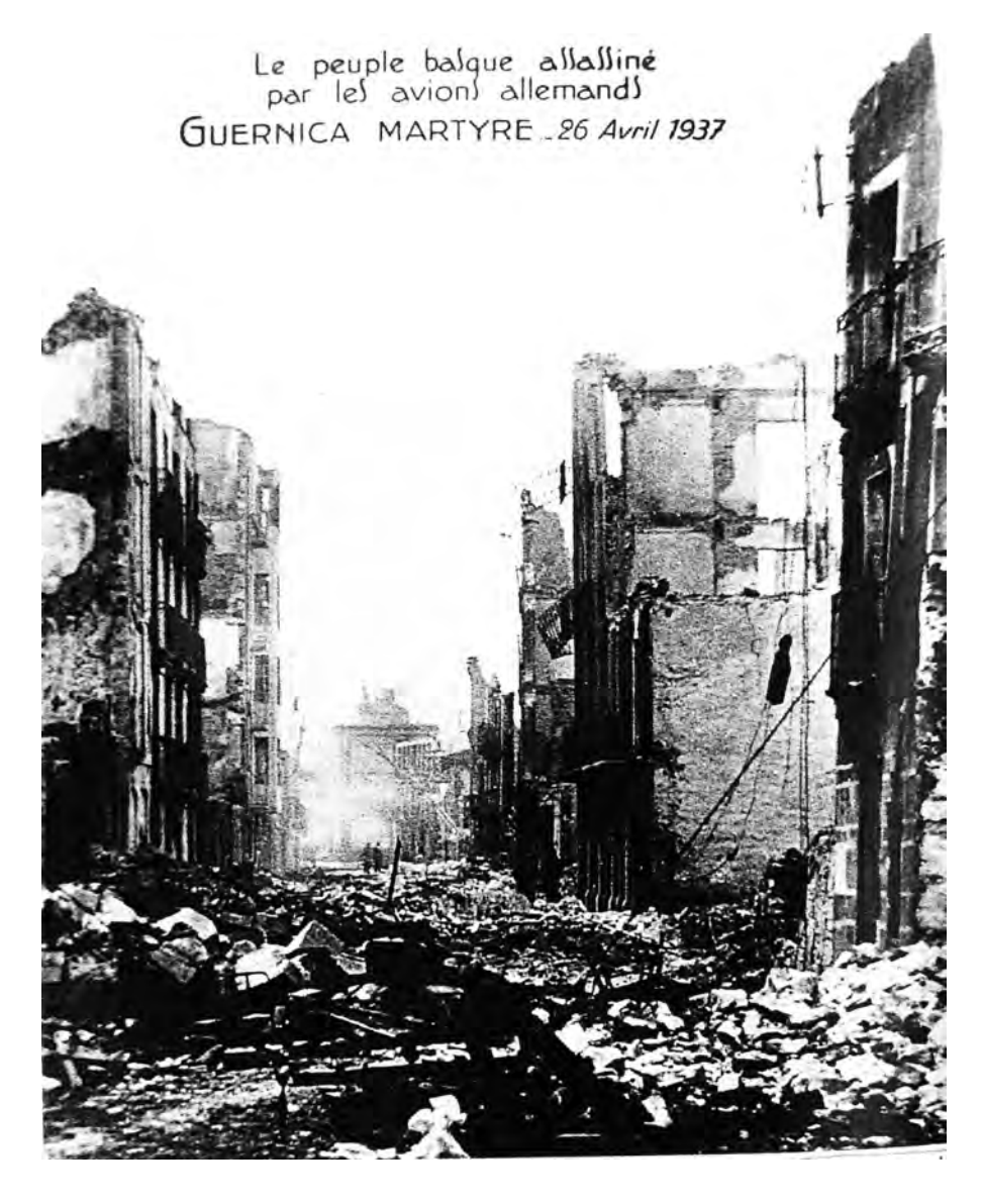
A postcard published in France shortly after the attack on Guernica. The writing at the top says, 'The Basque people murdered by the German planes. Guernica martyred – 26 April 1937.'