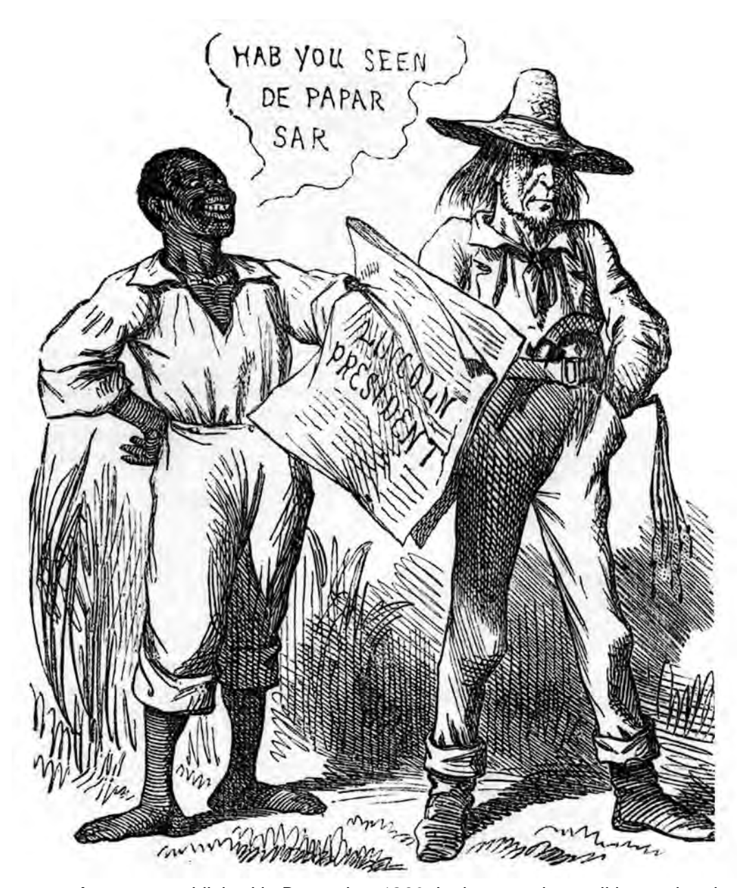
A cartoon published in December 1860. It shows a slave talking to the slave owner.