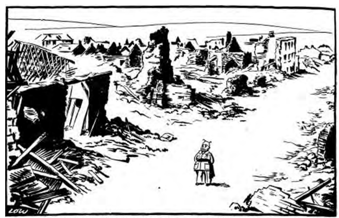
"YOU'VE GOT TO ADMIT I'M BRINGING PEACE TO THE POOR AND SUFFERING BASQUES."

A cartoon published in Britain on 21 June 1937. The figure in the cartoon is Franco.